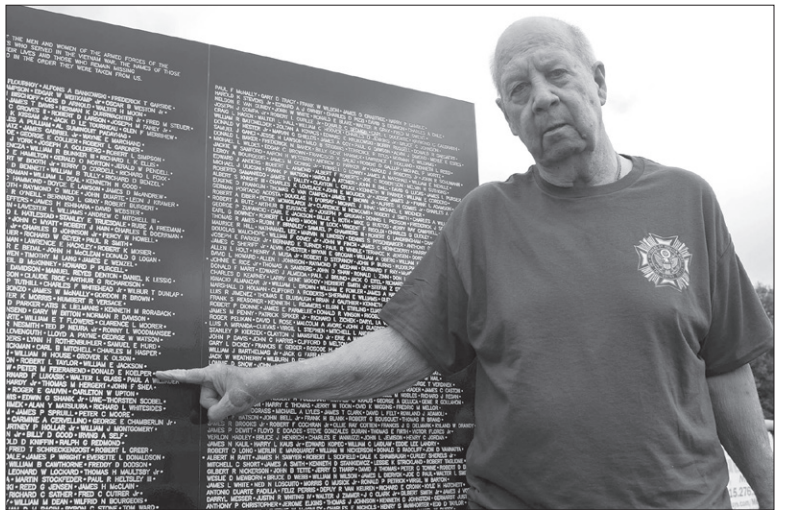
Friends and family gathered at the Vietnam Traveling Memorial Wall to honor local servicemembers or those they served with who were killed in action during the Vietnam War.