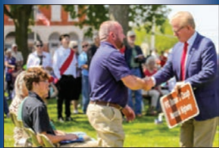
Honoring Vietnam Vets