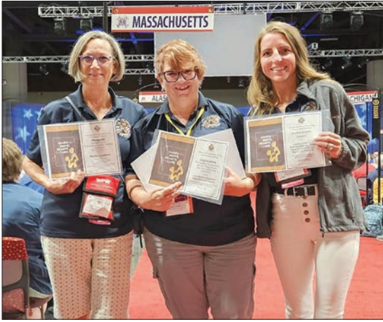
Illinois VFW Auxiliaries and members brought home several awards from the VFW Auxiliary National Convention held in Phoenix, Arizona in July.