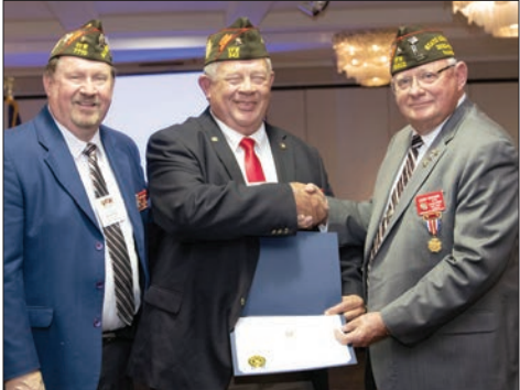
Col. Thomas G. Lawler Post 342, District 6, was honored as an All-State Post at the 104th Illinois VFW Convention in June.