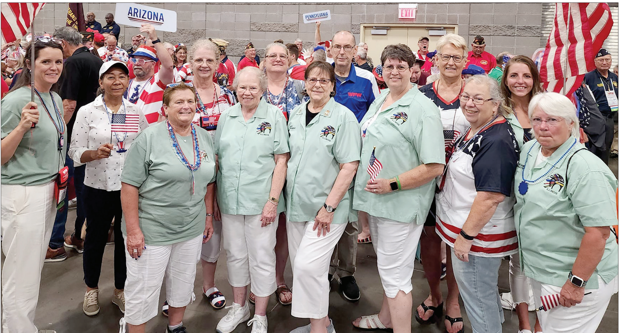
Some of the Illinois VFW Auxiliary delegates gather before stepping off at the National VFW and Auxiliary Convention's Patriotic Rally.