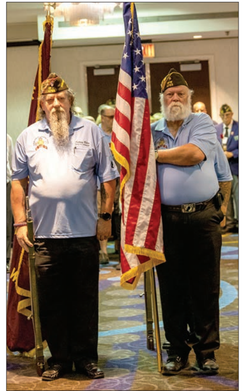
Chatham-Auburn Memorial Post 4763 color guard prepares to post the colors during the memorial service.