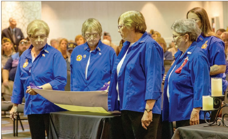
The Auxiliary Color Team presents the altar cloth during the Illinois VFW and Auxiliary Joint Memorial Service at the State Convention at Springfield, Illinois in June.