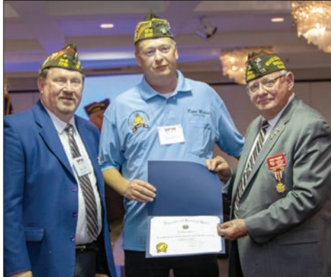
Hancock County Post 5117, District 8, was honored as an All-State Post at the 104th Illinois VFW Convention in June.