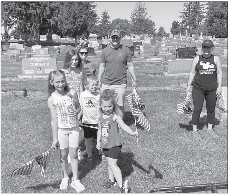
Some of the community volunteers who helped St. Juvín Post place flags on graves of veterans at Braceville-Gardner Cemetery.