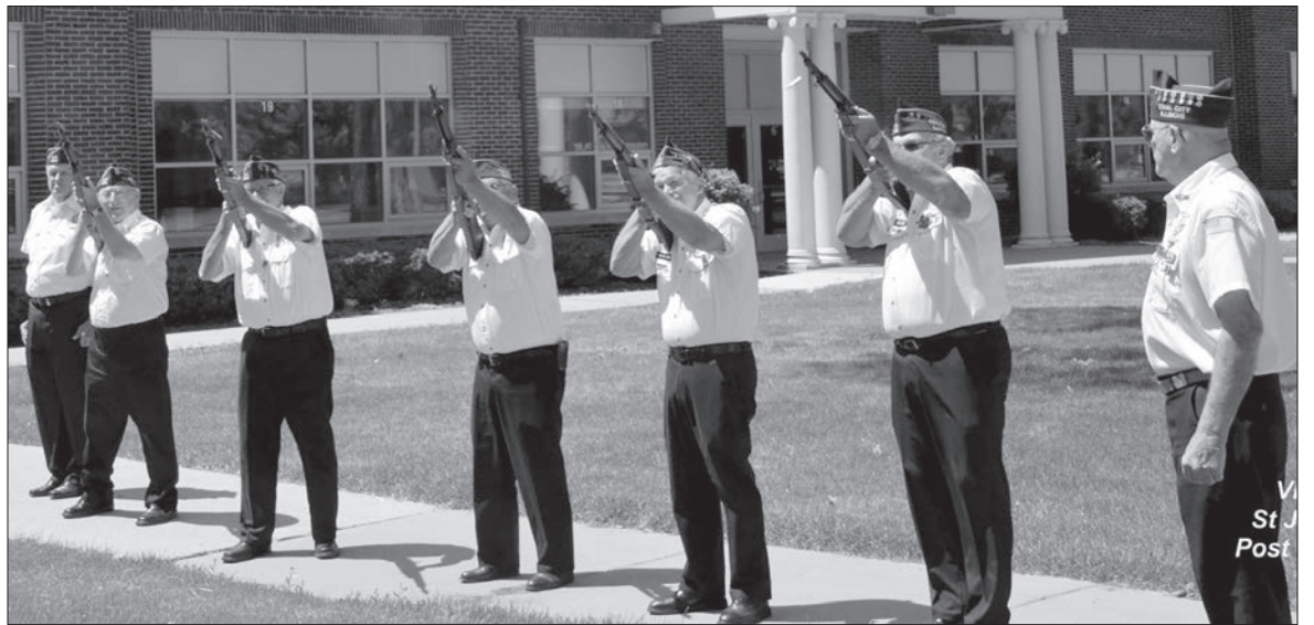
St. Juvín Post 1336 honor guard prepares to fire the ceremonial volley.