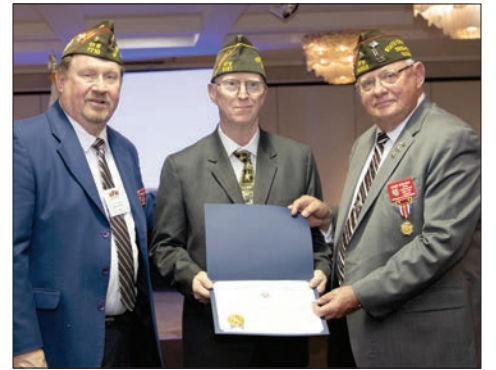
Arnold-Heath Memorial Post 5151, District 4, was honored as an All-State Post at the 104th Illinois VFW Convention in June.