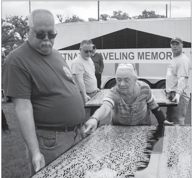
As volunteers unpacked the Vietnam Memorial Wall panels, the local servicemembers killed in action are recognized.

At the conclusion of the four days of display, the wall was packed up and moved on to its next location in Meridian, Mississippi. In August the wall will return to Illinois being set up in Peru and Rock Falls. For more information about the traveling wall visit travelingwall.us .