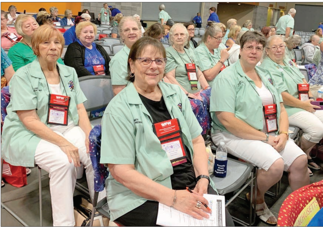
Despite the distance from Illinois to Arizona, several Illinois VFW Auxiliary members trekked to the Grand Canyon State for the annual VFW and Auxiliary Conventions in Phoenix in July. Delegates turned up the heat bringing home several awards and honors for both Auxiliaries and Posts.