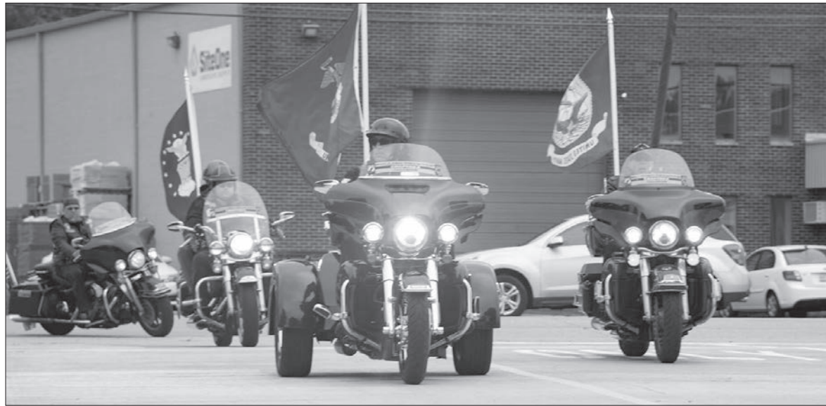
Amid a convoy of motorcycles, the Vietnam Traveling Memorial Wall is escorted onto the grounds of Fox River Post 4600 in McHenry.