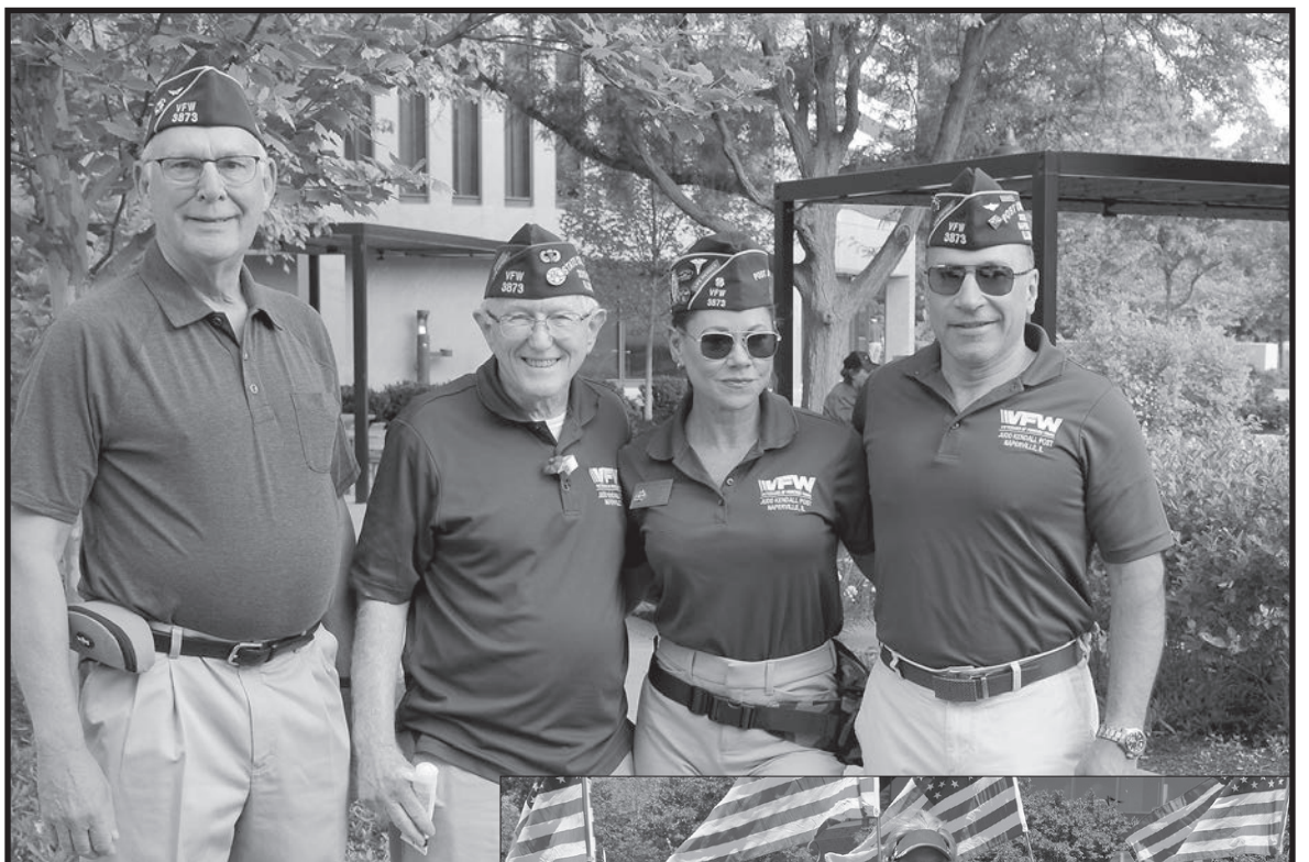
Members of the Judd Kendall Post 3873 and its Auxiliary in Naperville participate in the annual Naperville Memorial Day parade.