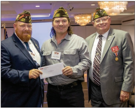
Kahokian Memorial Post 5691 in Collinsville was honored as the post with the largest increase in legacy life memberships with an increase of seven members.