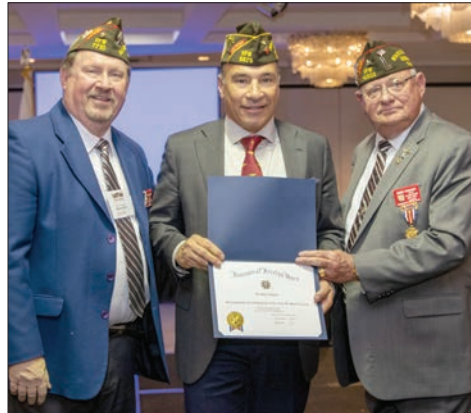
Judd Kendall Post 3873 was honored as an All-State post at the 104th State Convention in June.