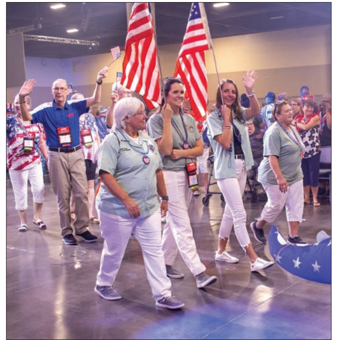
The Illinois VFW Auxiliary color team carries the flags during the Patriotic Rally at the VFW National Convention in Phoenix.