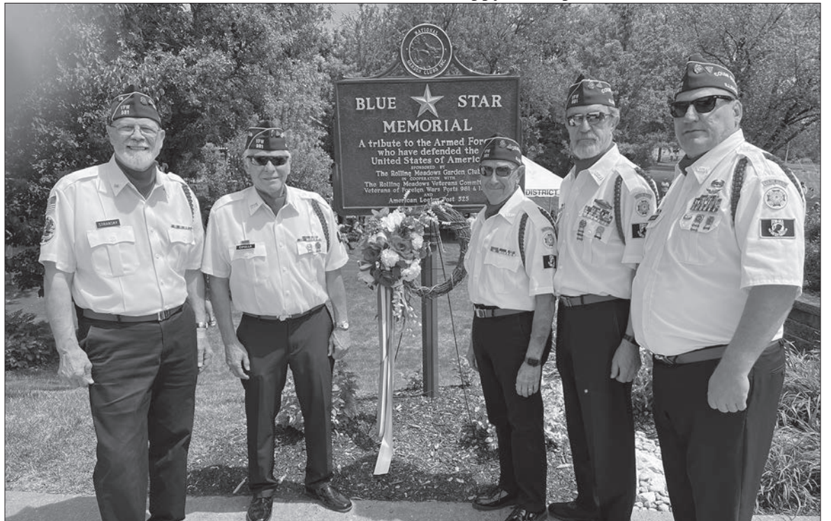
Members of Post 981 Color Guard alongside the Blue Star highway marker on Kirchoff Road in Rolling Meadows, Illinois.