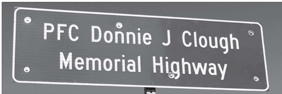
A replica of the Illinois State Route 133 sign designating the highway through Hindsboro as "PFC Donnie J Clough Memorial Highway."