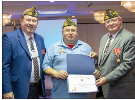
Schaumburg Post 2202, District 4, was honored as an All-State Post at the 104th Illinois VFW Convention in June.