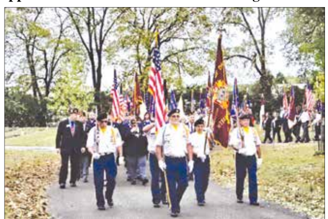
Veterans from the Department of Ohio march into the cemetery to honor the founders of the American Veterans of Foreign Service during Founders Day.