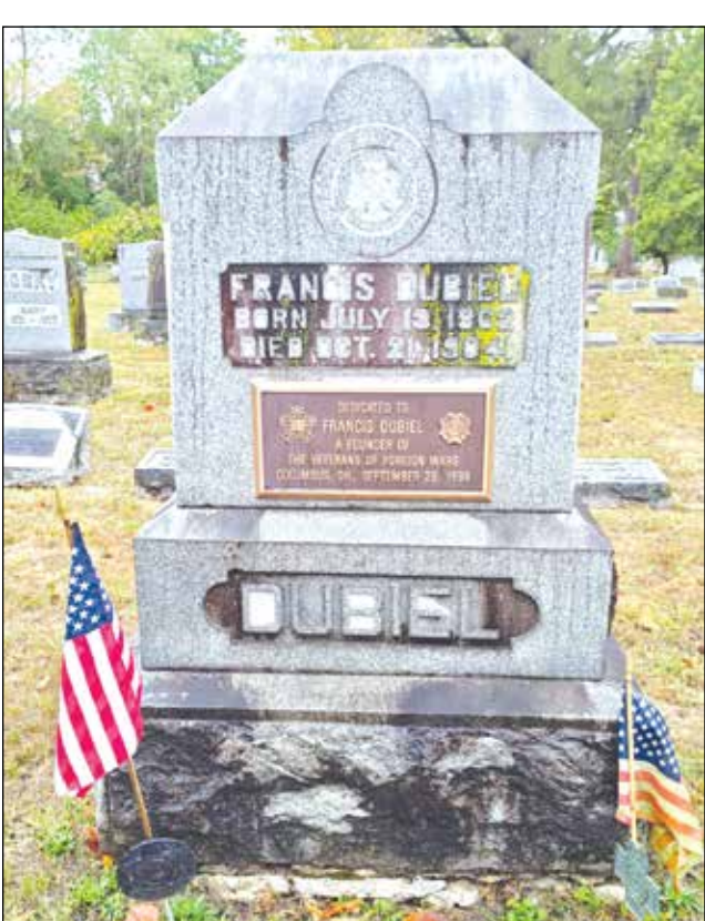
The gravesite of Francis Dubiel at Greenlawn Cemetery in Ohio.