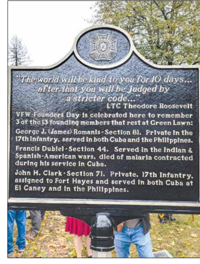
One side of the VFW Founder's Day marker.