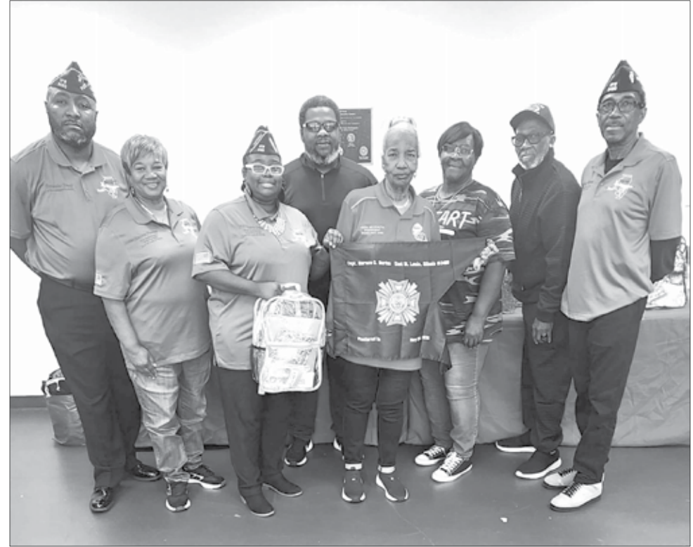
Capt. Horace G. Burke Post 3480 and Auxiliary, East St. Louis, held a back to school event to provide students clear backpacks and school supplies.