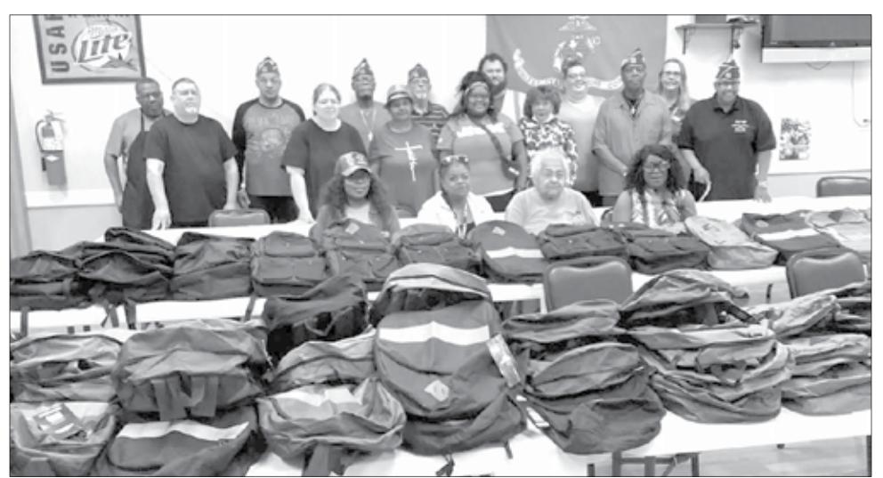
Waukegan Post 1293 and Auxiliary held a back to school event to give back to the community, providing book-bags and school supplies to students in the local community together with partners Mv Partners Transportation Service, members and volunteers.