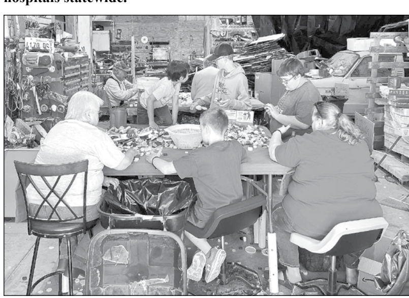
Teams sort out the caps before delivering them to Indiana to be made into benches.