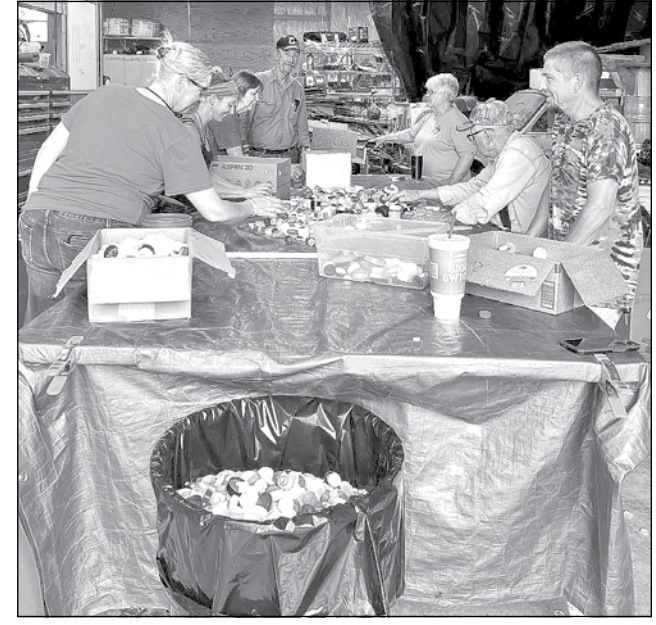
Teams sort out the caps before delivering them to Indiana to be made into benches.