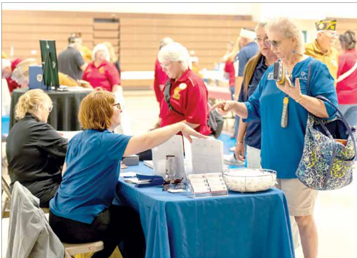
Donors check in with VFW National Home staff prior to the Illinois Day ceremony.