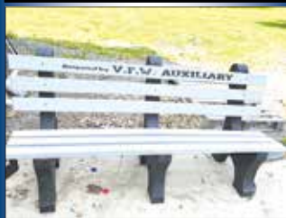
Bottle Cap Benches