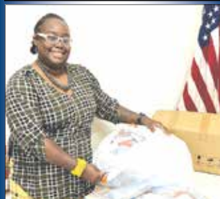
Hygiene Items Donation