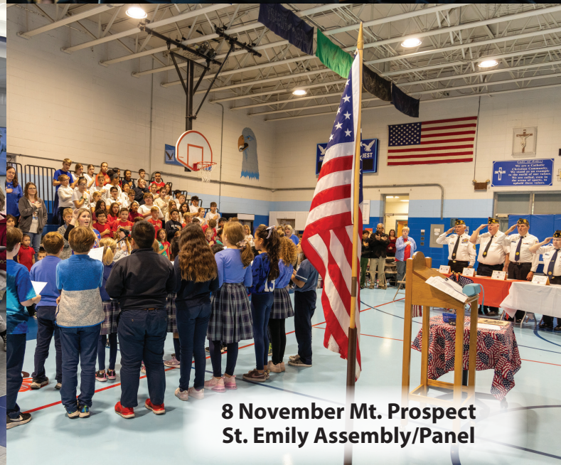
8 November Mt. Prospect St. Emily Assembly/Panel