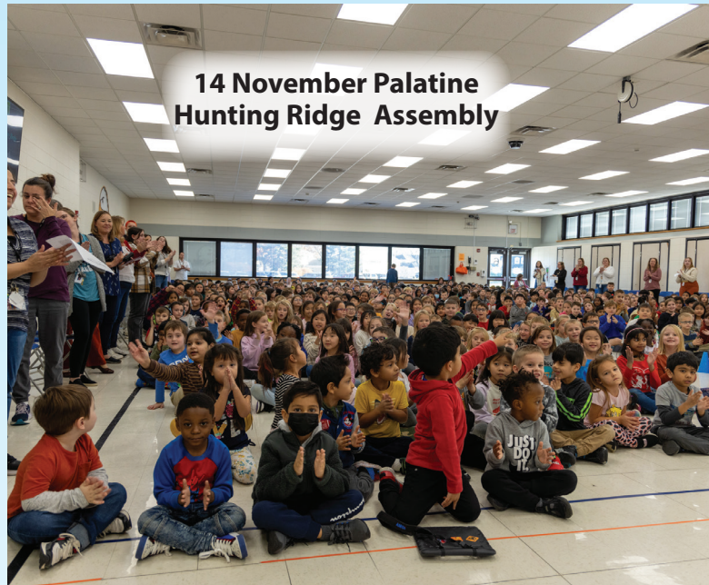
14 November Palatine Hunting Ridge Assembly