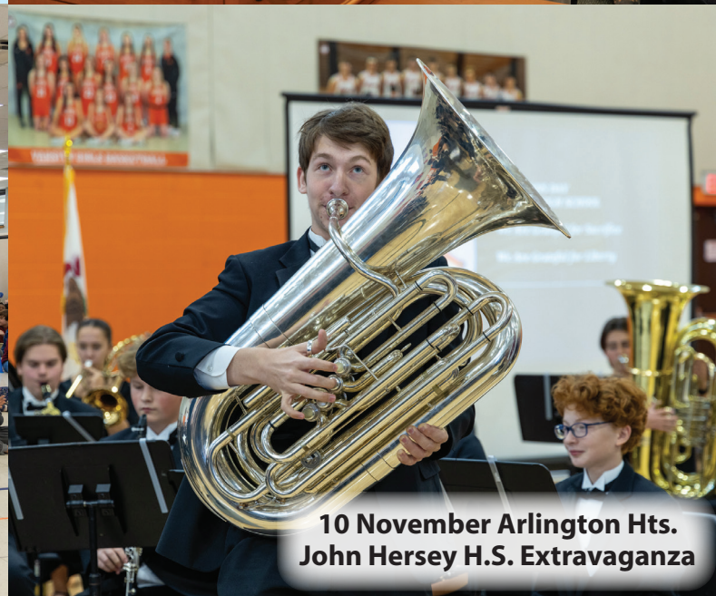
10 November Arlington Hts. John Hersey H.S. Extravaganza