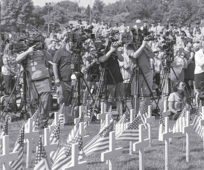
Our special thanks to our Active duty military as well as Taylor's Battery & Hamiltons Artillery