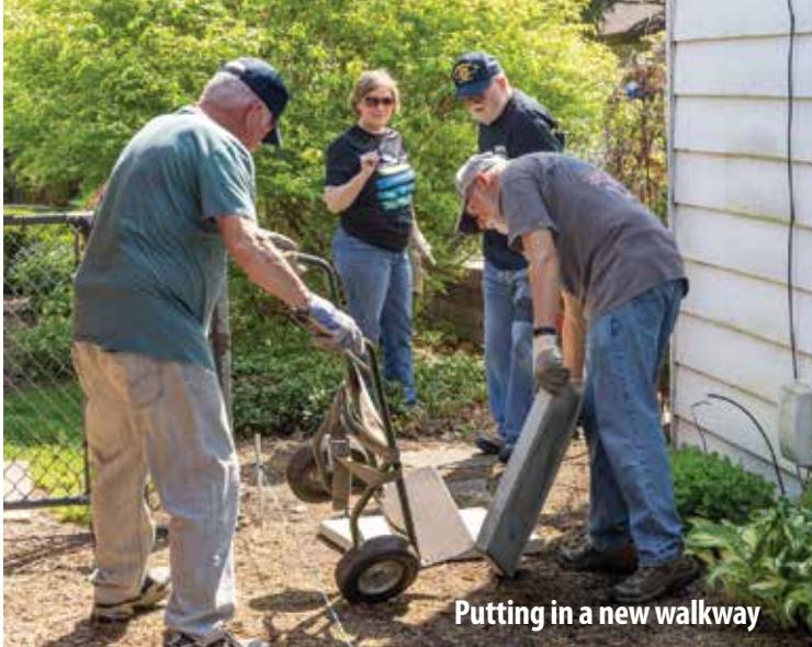
Putting in a new walkway