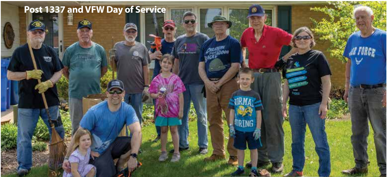
The Simmons Children pitched in and impressed all with their work ethic