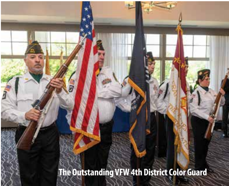
The Outstanding VFW 4th District Color Guard