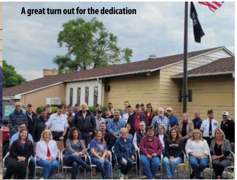
A great turn out for the dedication