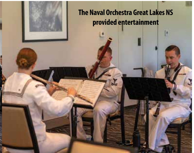
The Naval Orchestra Great Lakes NS provided entertainment