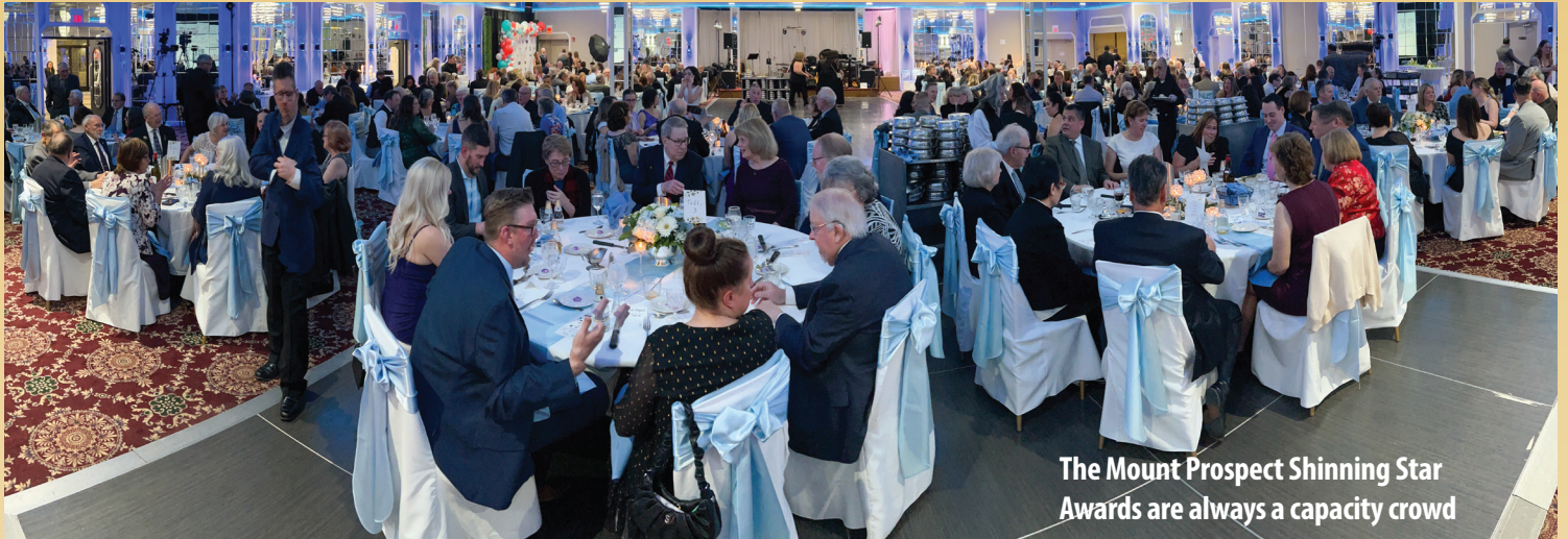
The Mount Prospect Shinning Star Awards are always a capacity crowd